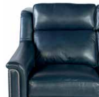
2 Piece Back (Add -2 to end of style #)