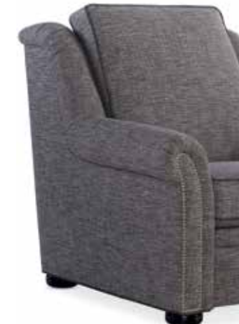
206: Teardrop roll arm (Standard with nail trim, no nail option available)