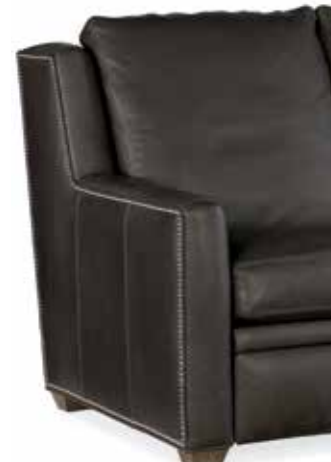
203: Elegant arm design with front pleat (Standard with Nail trim, No nail option available)