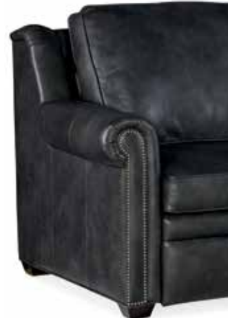
202: Pleated roll arm design (Standard with Nail trim, No nail option available)