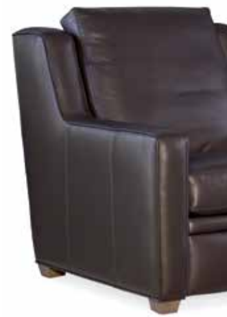
201: Modern track arm design (Nail trim not available)