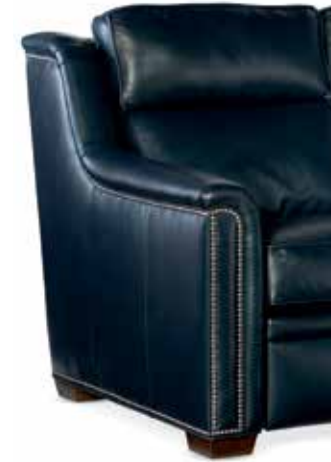
204: Transitional Pad over arm with nail detail (No nail option available)